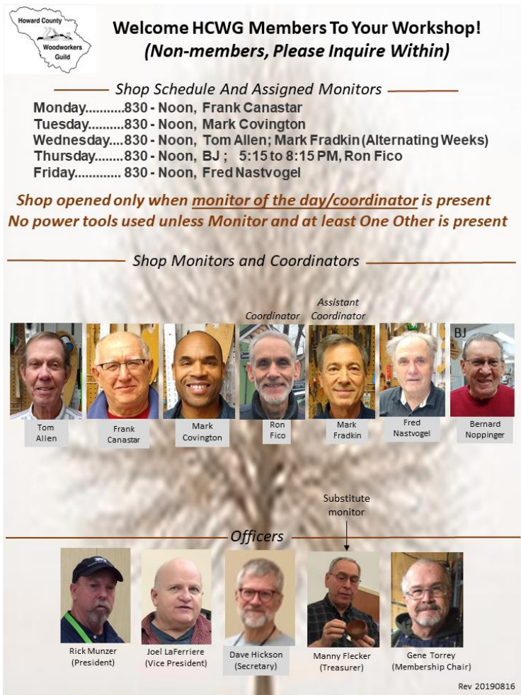
HCWG Shop Monitor Schedule September 2 - September 13, 2019